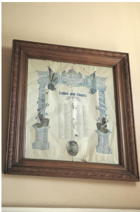
Talbot & Clunes Roll of Honour