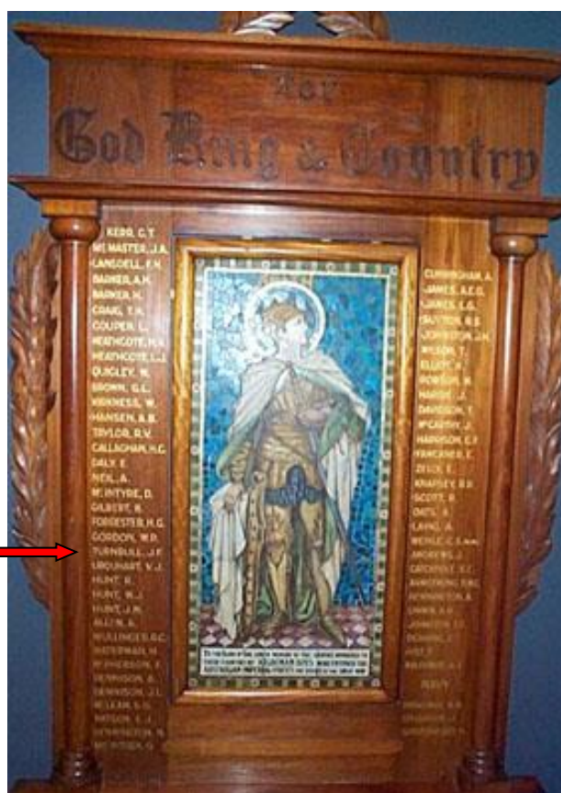
Collingwood Kildonan Presbyterian Home Honour Roll